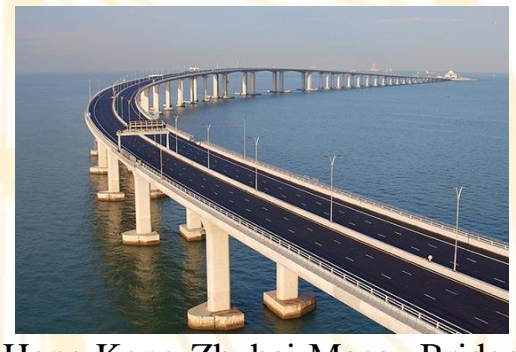
Hong Kong-Zhuhai-Macau Bridge

It has started to be operated from 24<sup>th</sup> October 2018 to link Greater Bay Area to International